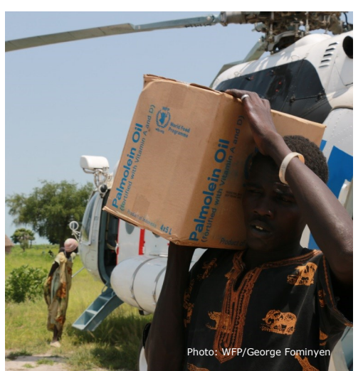
Representation of the World Food Programme in the Democratic Republic of Congo